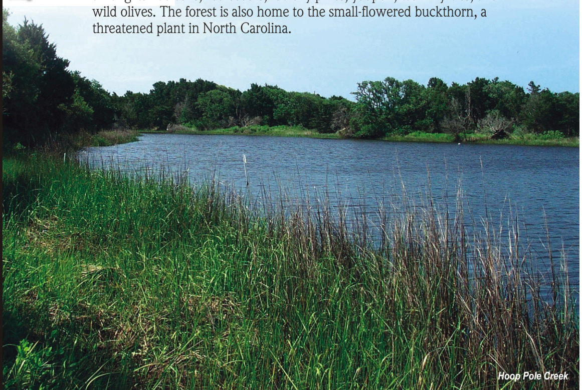
Hoop Pole Creek