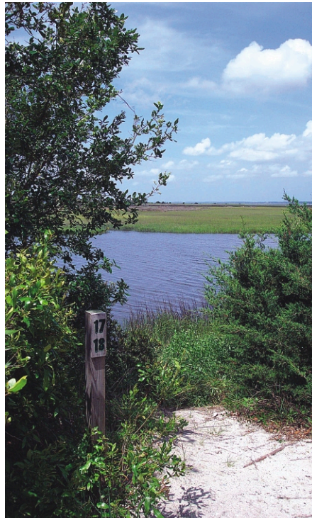
Overlooking Bogue Sound