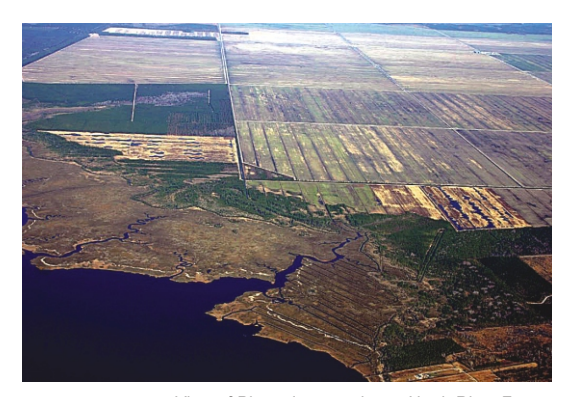
View of Phase I restoration at North River Farms.

Numerous granting agencies have participated in the restoration efforts of North River Farms. NOAA, EPA, US Fish and Wildlife Service, FishAmerica Foundation, NC Albemarle-Pamlico National Estuary Program, and North Carolina Wetlands Restoration Program are among the partners who have contributed to the success of this project.