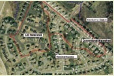
The Somerset LID saved hundreds of thousands of dollars.