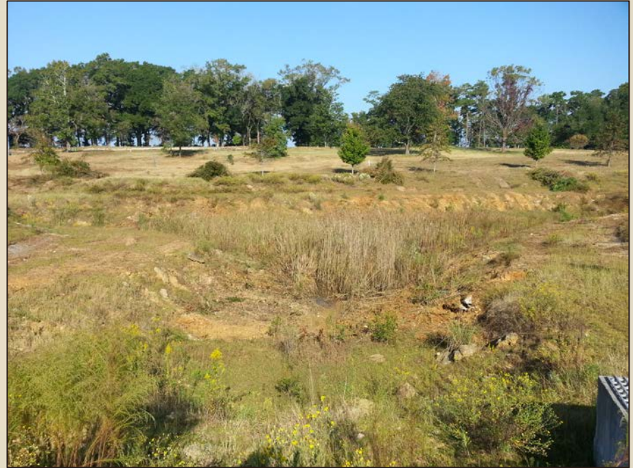
Wet Pond – Not!!