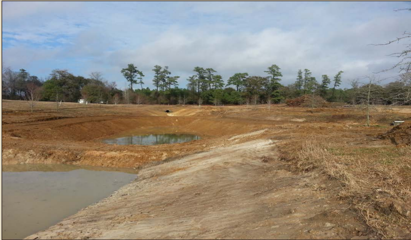
Future Wet Pond Cost