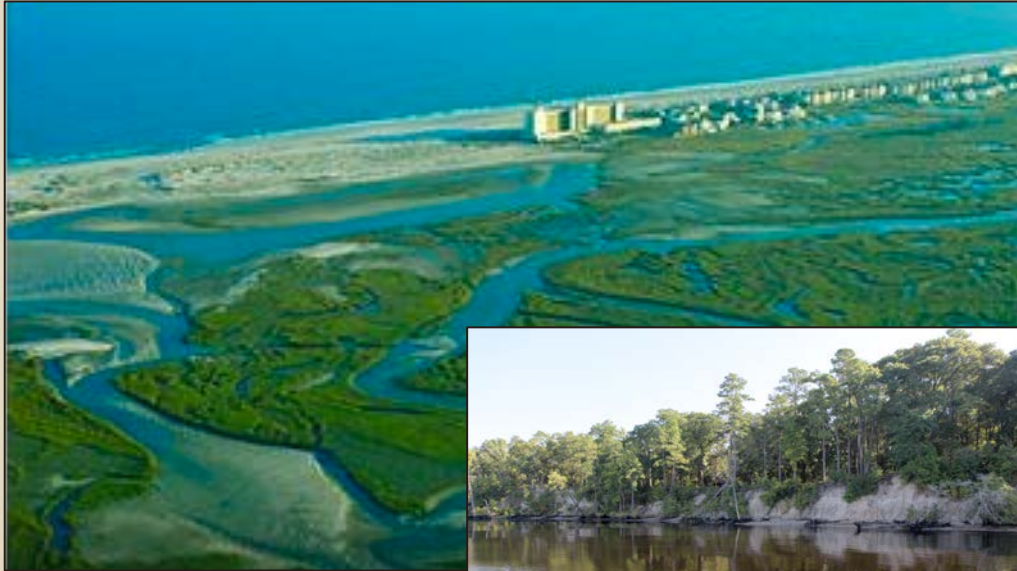
Wrightsville Beach, North End