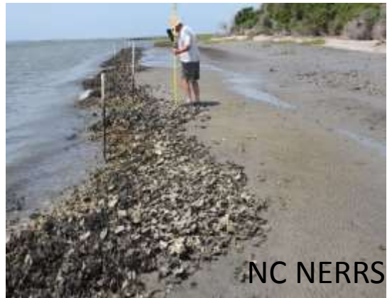
Oysters and Shoreline Stabilization 'Living shoreline" -provide guidance for utilization of oyster reef vs. stone sills