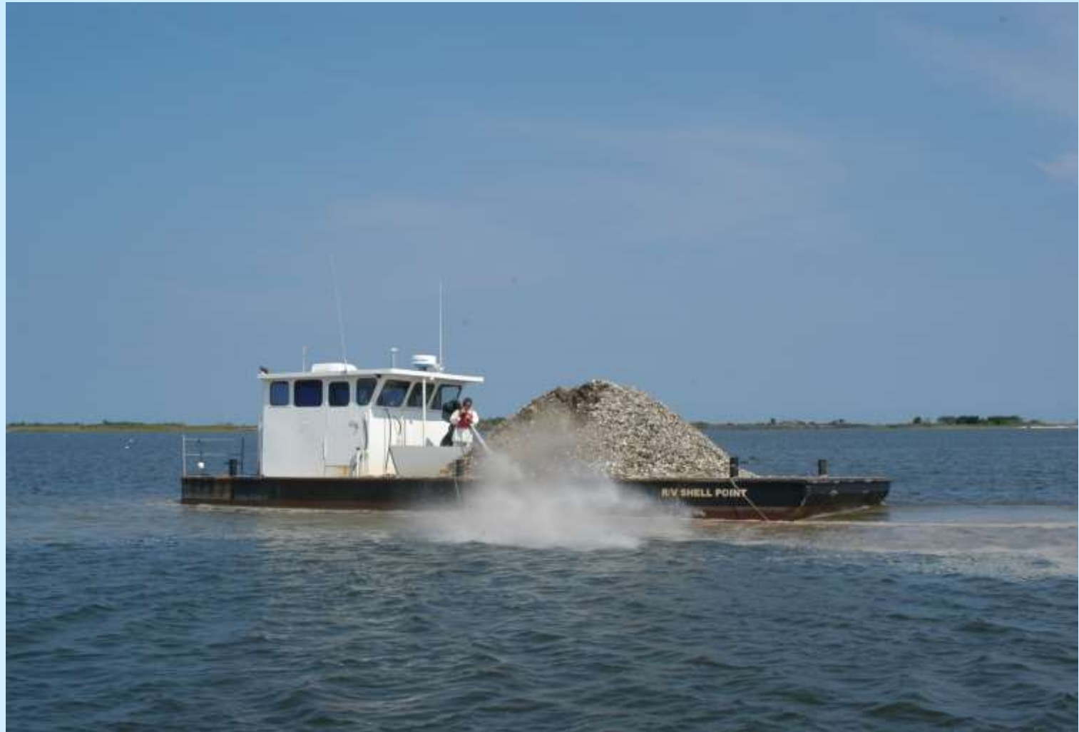
R/V Shell Point