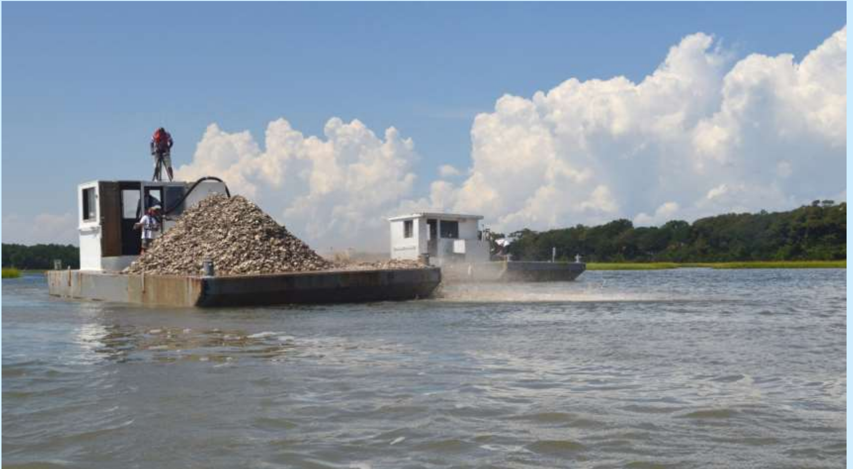
R/V Stones Bay and R/V Cape Fear Wilmington, NC