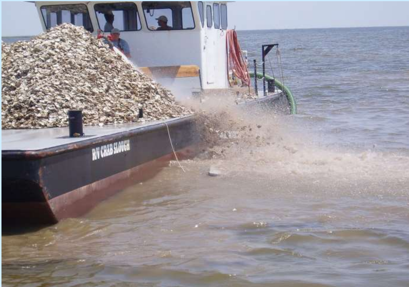
R/V Crab Slough Wanchese, NC