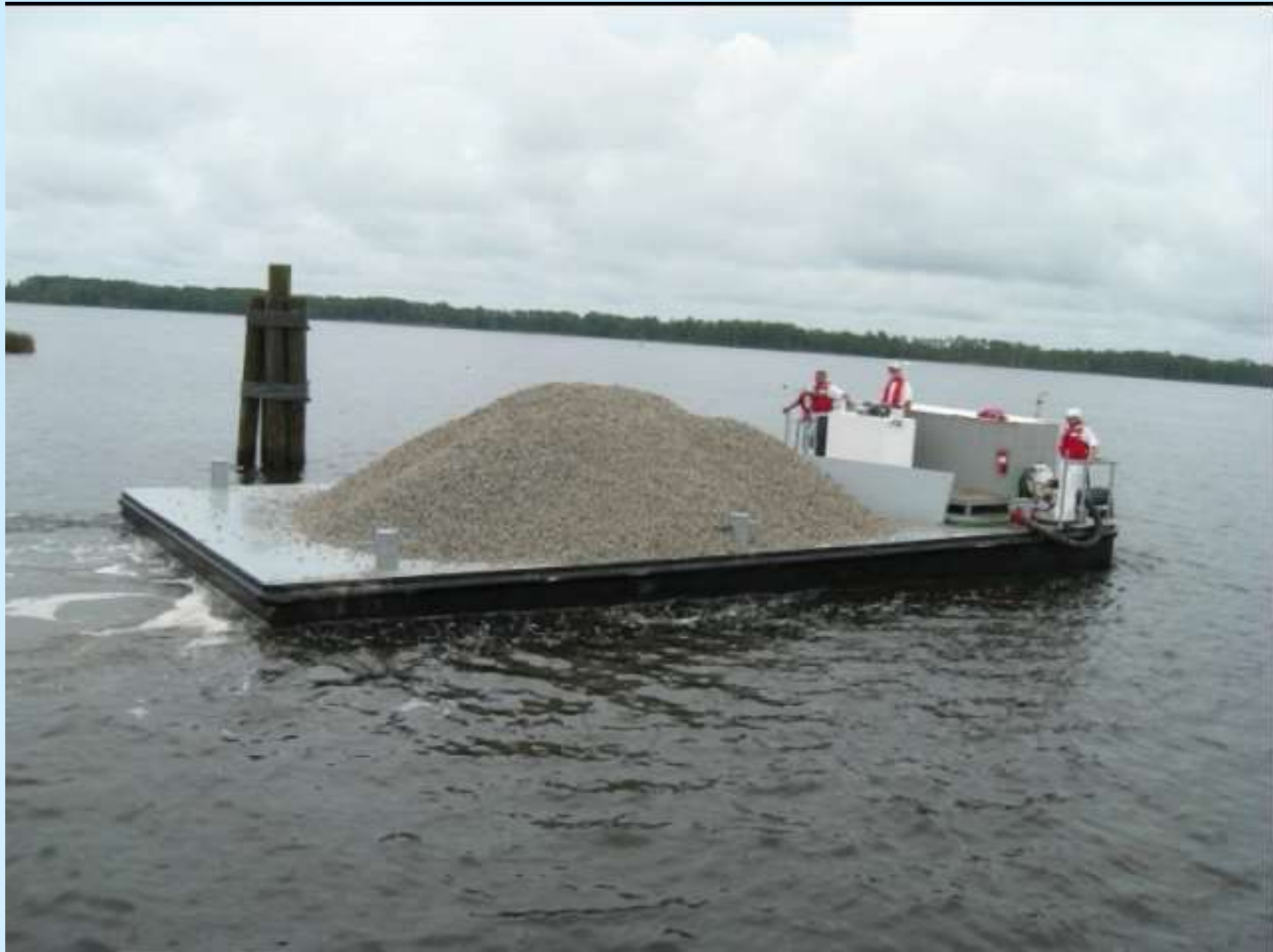
M/V Jones Bay South River, NC