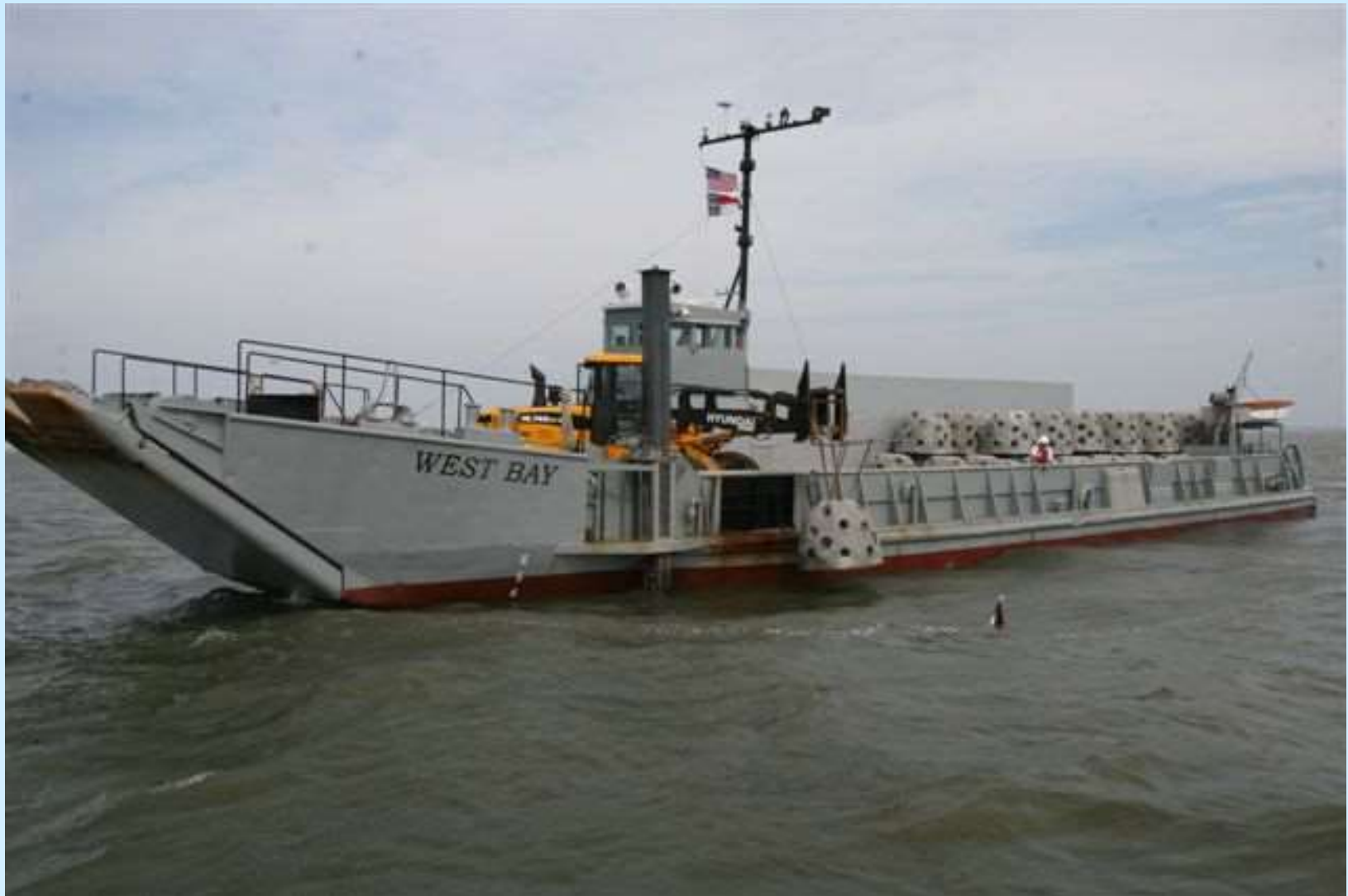
M/V West Bay South River, NC