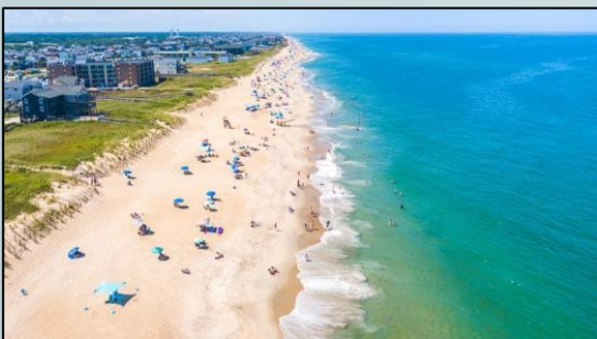
Coastal Management that Protects & Restores