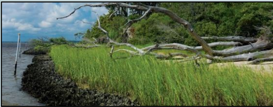
Healthy & Productive Living Shorelines