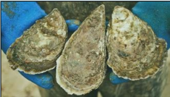
Abundant Oysters that Support the Environment and Economy