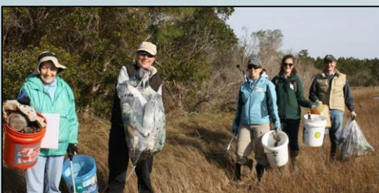
A Coast that is Free of Marine Debris